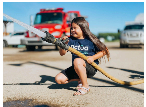
Outreach Camp, Northern Alberta, 2022