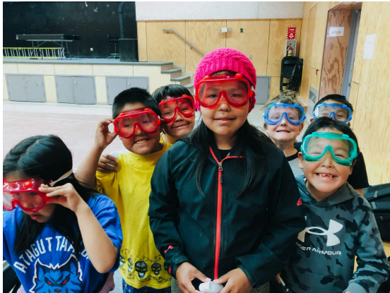
Outreach Camp, Kitikmeot Region, NU, 2022

Actua delivers week-long STEM camps, to youth, typically between the ages of 7-12, from July to mid-August. Each week is filled with fun, innovative, and hands-on projects designed to help youth learn about the science of everyday life, bringing in community members whenever possible to enhance this learning. Actua strives to be adaptable to the community's requests so we can create a camp program that suits the youth we are reaching. Actua works with communities to determine the logistics of