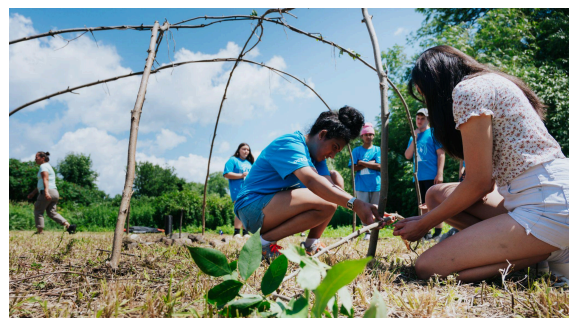
Top: Outreach Camp, Baffin Region, 2022 Bottom: Land Camp, Ontario, 2022