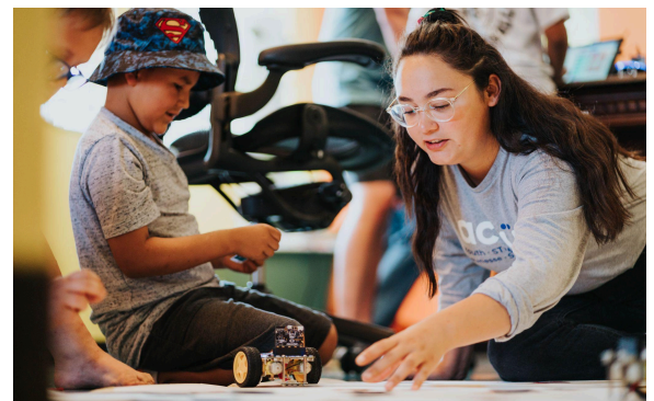
Outreach Camp, Northern Alberta, 2022

We believe breaking down barriers to STEM requires collaboration among key players within our innovation ecosystem – from government, public, and private sectors. In particular, our private sector supporters reflect the top industries driving innovation and economic growth in Canada, including agriculture, technology, manufacturing, banking, and energy. All of our supporters bring a wealth of resources, knowledge and expertise to our programs, whether it be through monetary contributions, mentorship, career exploration or skill development opportunities. In cases where our supporters directly contribute to a local program, Actua always consults the community before engaging the supporter. You can find a list of Actua's current supporters on actua.ca/supporters .