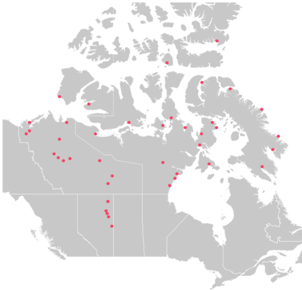
Communities with which the Actua Outreach Team partnered in 2024.