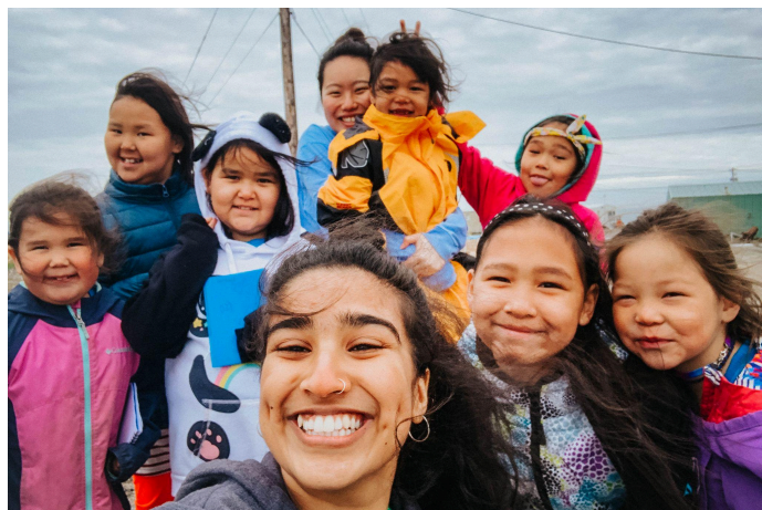
Outreach Camp, NU, 2018

Actua instructors deliver programming primarily in rural, remote and Indigenous communities that are not yet served by our network member programs. Through school workshops, week-long summer day camps, full-immersion land camps, and various other community events, Actua instructors engage 4,000-5,000 youth in 25-30 communities each year.