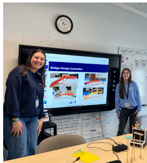
School Workshop, Inuvialuit Region, NT, 2024

Actua arranges logistics with the schools, principals, and teachers in advance of arrival to ensure the most is made out of Actua's time in the community. Communities, workshops, and school schedules may change rapidly throughout the tour. Flexibility and the ability to work in a fast-paced environment are key to being a successful workshop instructor.