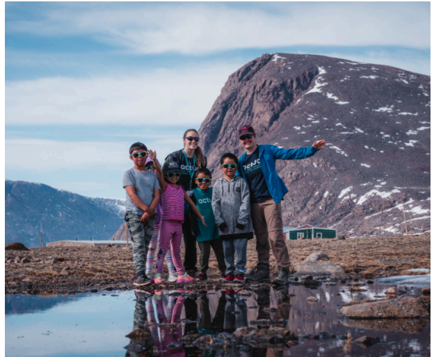
Outreach Camp, Baffin Region, NU, 2023

No two communities are the same, and not all communities have the same level of access to resources. Some of the greatest challenges these communities face also represent the greatest opportunities for STEM innovations.